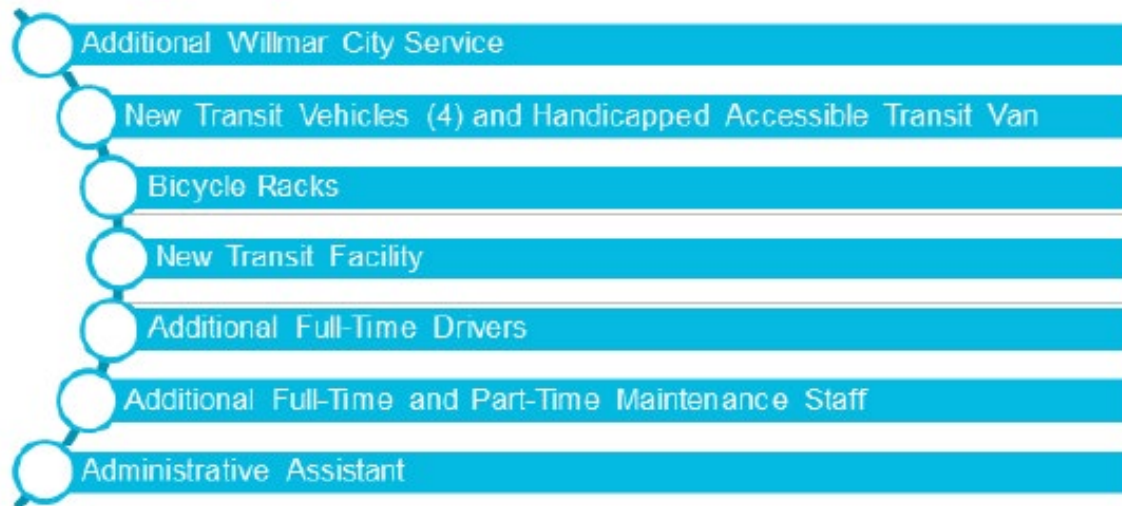
Figure 2. High Priority Unconstrained Needs for CCT